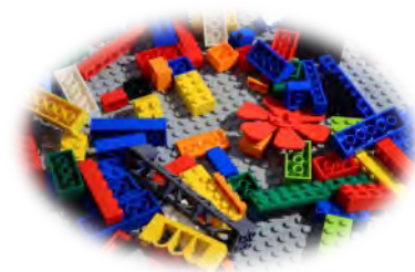
Exhibit in this section must be the work of the exhibitor.

Ribbons & Cards for 1st, 2nd, 3rd, Best Exhibit Rosette Awarded in this Section