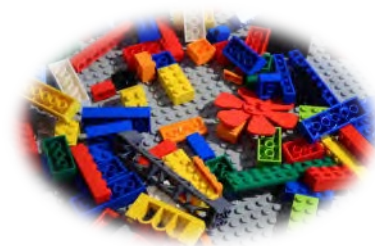
Exhibit in this section must be the work of the exhibitor.

Ribbons & Cards for 1st, 2nd, 3rd, Best Exhibit Rosette Awarded in this Section